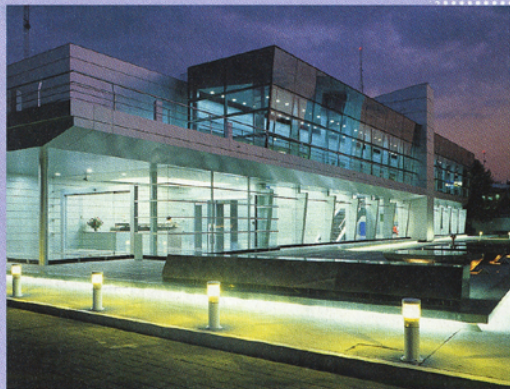
Bancrecer Tlalpan Computer Center Mexico City, Mexico Migdal Arquitectos Office/retail

The Bancrecer Computer Center, designed to serve 1,200 bank branches and 10,000 employees, is part of a trend in Mexico City of recycling buildings for new uses. The concrete shell of the existing building was re-used, after appropriate structural reinforcement, with new construction enlarging areas as required.