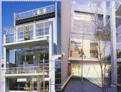
Belgrano housing Buenos Aires, Argentina Caram Robinsohn Architects Residential

It breaks with the 'bunker' tradition of other computer centres by maintaining a relationship with the interior areas around it, accessible to visits by employees and outsiders alike. It was designed with future flexibility in mind, and is capable of encompassing future projects and changes in personnel and internal spaces.